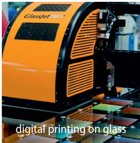
digital printing on glass